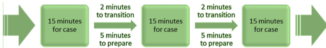
Figure 2: Timing of Part 1 stations.

the case. Then the Candidate will have 15-minutes to complete the task(s) of the station. (The Candidate is not required to use the full time if they have completed the task(s) of the station.) Two (2) minutes are allowed to transition between stations. (Additional time may be granted for variances in location settings and/or pursuant to an accommodation request – Form A2). See Figure 2 for the timing of Part 1 stations.