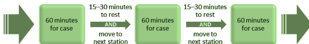
Figure 3: Timing of Part 2 stations.

Upon entering each station, the Candidate will give the four Candidate Identification Number labels for that station to the Rater. The Rater uses the labels to identify the Candidate's individual paperwork. The Candidate will have 60 minutes to review the case and complete the tasks of the station. (Candidates are not required to use the full time if they have completed the tasks of the station.) A warning signal will indicate when 10-minutes and 5-minutes are remaining in the station. Fifteen (15) to thirty (30) minutes are allowed to transition between stations. See Figure 3 for the timing of Part 2 stations.